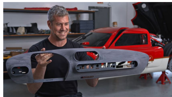
The 3D printed dashboard instrument panel will be covered with leather before installation.