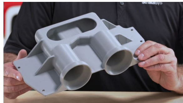
ASA heating/cooling duct production part ready for under-dash installation.